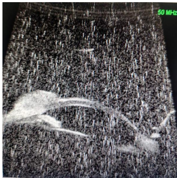
Fig 2: UBM imaging of left eye suggesting corneo scleral involvement of lesion without involvement of angle structures.