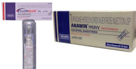
Figure 1- chloroprocaine and Bupivacaine ampoules