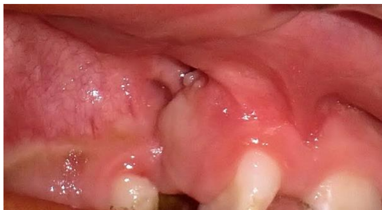
Figure 1 : PreOperative Fistule

Early post-operative: Sutures were removed within 14-21 days post-operatively. Soft tissue healing was optimum, mostly related to poor oral hygiene. This was treated by local wound care using Povidone Iodine mouthwash, Hyaluronic acid gel and Miconazole Nitrate gel three times daily for ten days. Systemic antibiotic were also prescribed for five additional days. Improvement of oral hygiene was stressed on for the patients and guardians in addition to adequate nutrition. There was improvement at the recipient site in the next follow up visit following treatment.