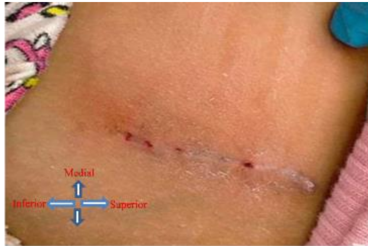
Figure 2 : Picture showing donor site 10 days postoperatively

Donor site assessment was one of the integral steps in clinical follow up. All patients experienced tenderness which was not spontaneous and only during walking during the first post-operative week up to 10 days, which was relieved by analgesics. No paresthesia or numbness nor infection or gait disability were found in any of the cases. Sutures were removed on the 10th post-operative day. (Figure 3)