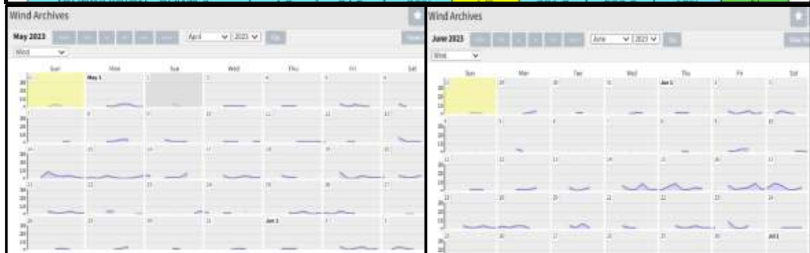
Images (5-9): Showing average humidity, rainfall and wind velocity (IMD)