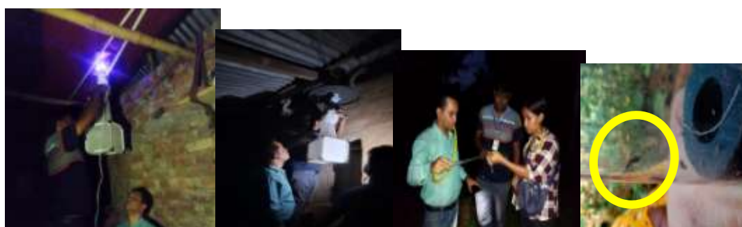
Image (1-4): CDC mosquito trapping by entomology team, MRHRU, Khumulwng

It shows that mosquitoes species which are predominant in the locality was Anopheles subpictus , which it is a potential natural vector of malarial parasite Plasmodium falciparum and Japanese encephalitis virus. It is highly susceptible to insecticide deltamethrin and resistant to DDT.