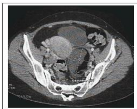
Figure 2: left latero uterine mass