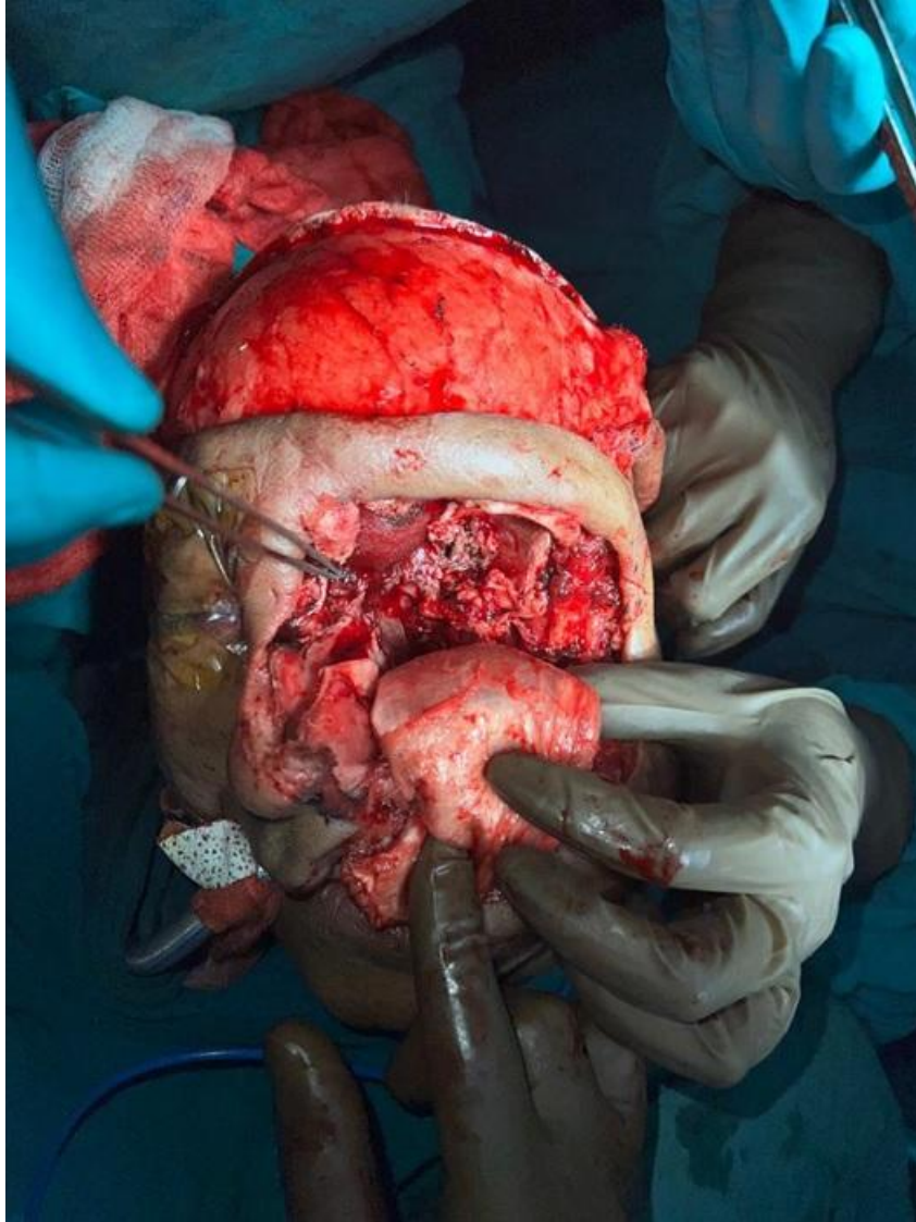
Figure 3 Description here