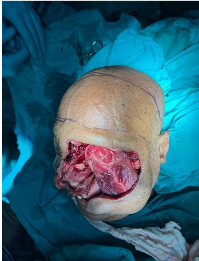
Figure 4 Description here