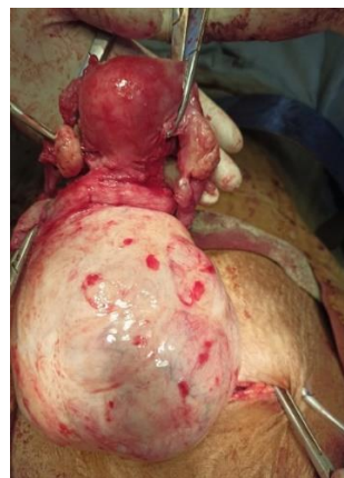
Fig-2: Fundus and body of uterus at the top of cervical fibroid.