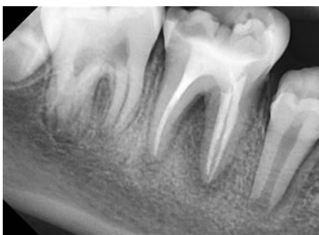
Figure 2. Apical radiograph of tooth # 46 after obturation.

After two weeks, the medication was removed with the instrumentation and irrigation with 3% NaOCl. As the patient was asymptomatic, the canals were dried and filled. The obturation was performed using continuous wave technique with gutta-percha and AH Plus (Dentsply International Inc., York, PA, USA) (Figure 2).