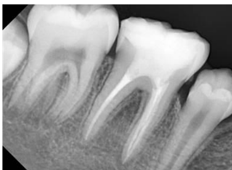
Figure 3. 3 months follow-up visit. Healing was observed in the furcation and the periapical areas of tooth # 46.

After obturation, the patient was referred to the restorative treatment. The tooth was restored with a onlay composite restoration. The patient was recalled after 1 weeks, 1 and 3 months, periapical and furcation healing was observed (Figure 3).