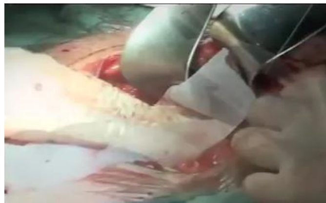
Figure 7: Prolene mesh is kept in preperitoneal region