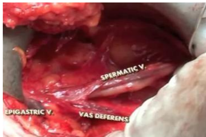
Figure 6: Spermatic cord and cord structures are identified and separated from hernia sac carefully