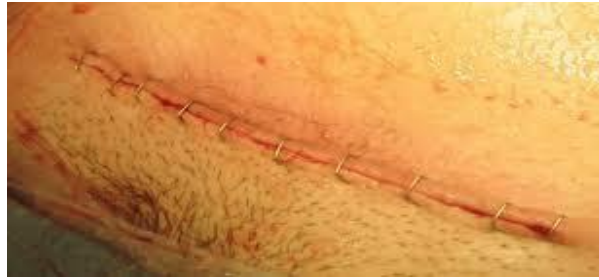
Figure 8: Skin is closed with staples

Inj. Ceftriaxone 1gm intravenously was given for all patients half an hour prior to surgery. Post operatively analgesia in the form of Inj. Diclofenac single dose and then Tab. Diclofenac 50mg twice a day for next 2 days was given to all patients. Per urethral catheter was done in all patients of Stoppa's group.