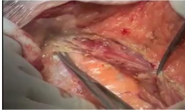
Figure 5: Vertical separation of both recti done to enter pre-peritoneal space

Direct hernias were identified and reduced. Large sacs were removed and ligated with a purse-string suture. Indirect sacs were divided, the proximal peritoneum was sutured, and the distal peritoneum was left in place attached to the cord. Separation of the spermatic cord and gonadal vessels was performed by dissection of their peritoneal attachment. Two prolene mesh of 15 by 15cm 2 were placed in the preperitoneal space in bilateral inguinal region. Fixation of the mesh was done by suturing mesh with pubic tubercle on both sides.