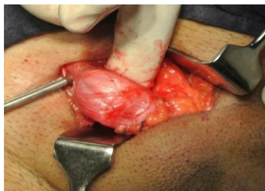
Figure 1: Separation of Sac and Cord structures

With the cord retracted upward, the sharper corner is sutured with a nonabsorbable monofilament suture material to the insertion of the rectus sheath to the pubic bone and overlapping the bone by 1 to 2 cm. This is a crucial step in the repair because failure to cover this bone with the mesh can result in recurrence of the hernia. A slit is made at the lateral end of the mesh, creating two tails, a wide one (two-thirds) above and a narrower one (one-third) below. The wider upper tail is grasped with forceps and passed toward the head of the patient from underneath the spermatic cord; this positions the cord between the two tails of the mesh. The wider upper tail is crossed and placed over the narrower one and held with a hemostat. With the cord retracted downward and the upper leaf of the external oblique aponeurosis retracted upward, the upper edge of the patch is sutured in place with two interrupted absorbable sutures, one to the rectus sheath and the other to the internal oblique aponeurosis, just lateral to the internal ring.