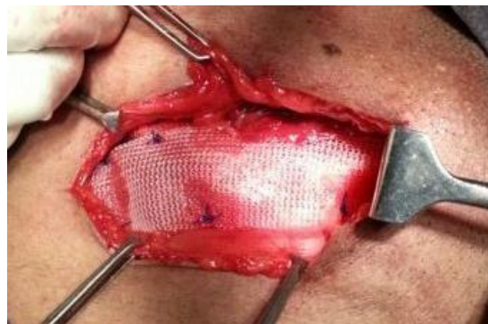
Figure 4: Placement and fixation of mesh with stay sutures

Using a single nonabsorbable monofilament suture, the lower edges of each of the two tails are fixed to the inguinal ligament just lateral to the completion knot of the lower running suture. The excess patch on the lateral side is trimmed, leaving at least 5 cm of mesh beyond the internal ring. This is tucked underneath the external oblique aponeurosis, which is then closed over the cord with an absorbable suture.