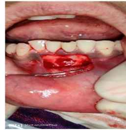
Fig2: Flap raised