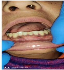
Fig1: Pre operative image