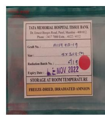
Fig4 : (a)Intra operative site of the lesion ,(b)Biodentine retrograde filling material (c)Freeze dried irradiated Amnion membrane

A xenograft bone graft material (SYBOGRAF™ - PLUS) (EUCARE PHARMACEUTICALS PRIVATE LTD , Chennai , India ) , synthetic bone graft .Platelet rich fibrin (PRF) preparation protocol described by Choukrounet.al was used