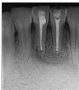
Fig 7 : After 1 month (post operative)

In our reported case the amniotic membrane acts as a reservoir of Multi-Potent Stem cells, which aids in the acceleration of the healing process. It also has many advantages over other materials in properties such as immune modulatory effects, anti-scarring and anti-inflammatory properties, and so on. Pain has been reduced. The use of amniotic membrane in conjunction with bone graft increases the osteoinductive and osteoconductive properties, thereby enhancing alveolar bone formation. Amniotic membranes have many distinct properties when compared to traditional GTR membranes, placental barriers, and amniotic fluid . To begin with, the Amniotic membrane contains a variety of proteins that provide a bioactive matrix to aid in wound healing, such as collagen types I, III, IV, V, and VI, as well as laminin. Placental barriers, in addition to providing a bioactive matrix, have been shown in studies to have antibacterial properties and to reduce inflammation by inhibiting macrophages and polymorphonuclearneutrophils 2 . As a result, the use of a membrane reduces the likelihood of anterior tooth recession and provides the much-needed impetus for surgeons to perform surgeries in the aesthetic zone with confidence .