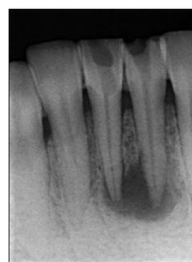
Fig3: Pre operative

A 26 years old patient reported with the chief complaint of dull pain and swelling in her lower front tooth region for the past 2 months and wanted to be treated .The patient gave a history of treatment in relation with 31 and 41 . Patient's medical history was non contributory .Patient gave a history that she has undergone dental treatment (private setup ) for the same tooth two months ago once she noticed discoloration of teeth and was suffering from intermittent pain .The patient was referred to The Department Of Conservative Dentistry And Endodontics for management .