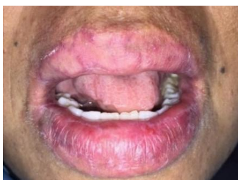
Figure 3: Clinical features showed a white striae on the lips at tenth week.