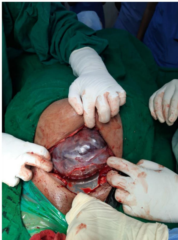
Case 1: Intraoperative findings of thick vasculature and ballooning of the lower segment of uterus, indicating Placenta Percreta