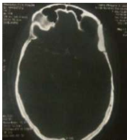
Figure 2: Post operative CT scan showing the extent of the bony removal with acrylic material reconstruction of the fronto-pterional vault

Proptosis reduction was obtained under different degrees early after surgery with the rate of 60% depending on the previous proptosis state. Good cosmetic results were achieved for the majority of our cases. Reconstruction of the frontal vault was performed in 12 patients operated from diffuse SOM.