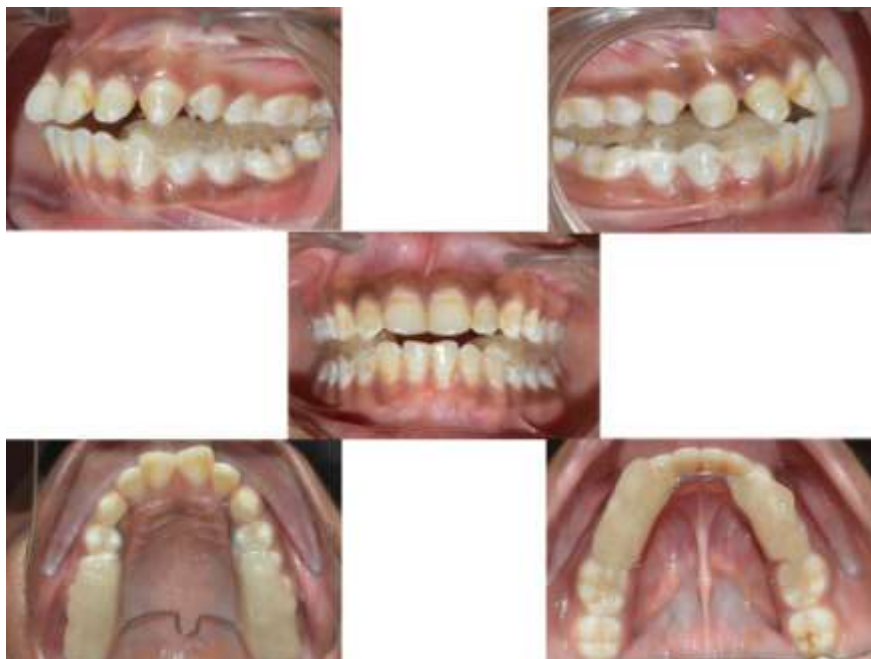
Figure 3- photograph after appliance placement.

Figure 3 shows the appliance after placing in patient's mouth. Fabricated appliance is fixed to the upper and lower arch with Type 1 GIC.