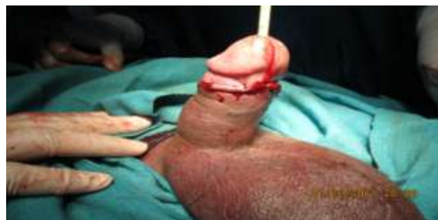
Fig. 5. Photo showing completed reanastomosis .

The patient recovered well in hospital and was discharged on postoperative day 2 on antibiotics with a Foley catheter to straight drainage and suprapubic catheter capped. The patient was advised to abstain from intercourse for at least 4 weeks. The patient underwent a RGU on postoperative day 21, which was found normal with no contrast extravasation (Fig. 6). The urethral catheter was therefore removed, with the capped