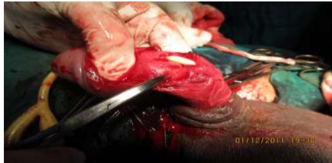
Fig. 2. Intraoperative photo demonstrating bilateral transverse rupture of the corpora cavernosa & urethra

catheter with 3-0 PDS suture with a simple interrupted end-to-end primary reanastomosis in a tension-free fashion (Fig.4). Two to three small scrotal incisions were taken & hematoma was drained