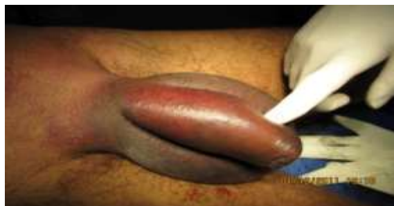
Fig. 1. Penile fracture with scrotal hematoma.

Physical examination demonstrated a tender and swollen penis with hematoma extending over the proximal penile shaft, scrotum and perineum. This examination suggested extension beyond Buck's fascia, but the hematoma appeared contained within Colles' fascia (Fig 1). "Rolling sign" was present bilaterally, palpated at the sites of tunical disruption about 3 cm from the base of the penis and was tender on examination. The scrotum was swollen and painful to palpation,