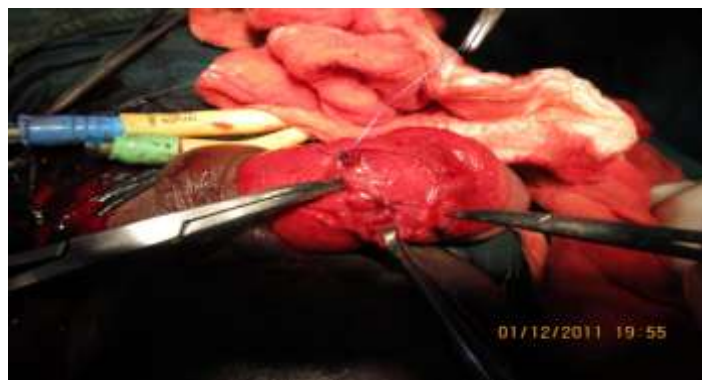
Fig. 4. Photo showing completed reanastomosis .