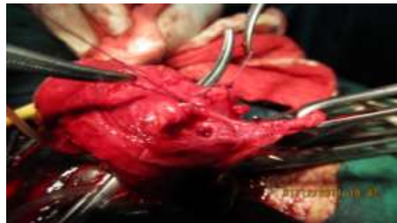
Fig.3. Photo showing primary reanastomosis of urethra.