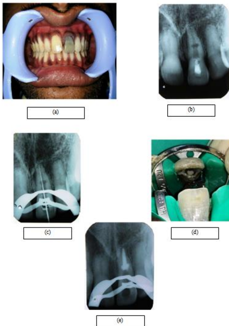
FIGURE 1: (a) Preoperative clinical view (b) Preoperative radiograph (c) working length radiograph (d) clinical view after MTA fill (e) Confirmatory radiograph after downpack and MTA fill in resorptive defect

Figure 1: (A) Preoperative clinical view (B) Preoperative radiograph (C) Working length radiograph (D) Clinical view after MTA fill (E) Confirmatory radiograph after downpack and MTA fill in resorptive defect Figure 2: (A) Immediate radiograph after backfill (B) Final radiograph after composite restoration (C) Postoperative clinical view after crown cementation (D) One year follow up radiograph