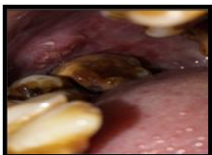
FIGURE 1 .1

Oral cancer continues to be a deadly disease for more than 50% of the cases diagnosed every year. This is due to the fact that the majority of those cases are diagnosed once they have already progressed to the advanced stage. The stage of advancement of oral squamous cell carcinoma at the time of diagnosis is the most important prognostic factor. Despite advances in various treatment modalities such as chemotherapy, radiotherapy, surgery, and gene therapy, the 5-year survival rate for oral cancer has not improved significantly over the past several decades and it remains at about 50%–55%. Therefore Invention of new tumor markers with high sensitivity and specificity can lead to early detection of oral cancer and may minimize the damage. Hence educate the overall population about carcinoma and much stress has to be laid on the stoppage of the usage of heavy alcohol drinking ,betel quid, arecanut, tobacco, in all forms-irrespective of age, community and socio-economic status as it is a must to combat mortality and morbidity arising out of it.