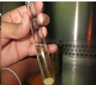
Fig 5: Specimens placed in test tubes with bacteria for biofilm formation