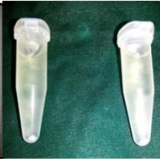
Fig 2: Pellet of bacteria obtained after centrifugation