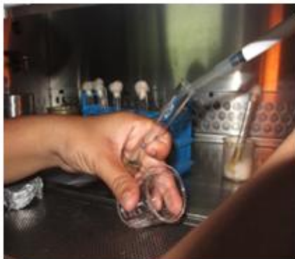
Fig 7: Sonicated bacterial suspension transferred to test tubes containing the culture media