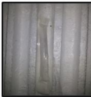
Fig 1: freeze dried Streptococcus mutans (MTCC 890)