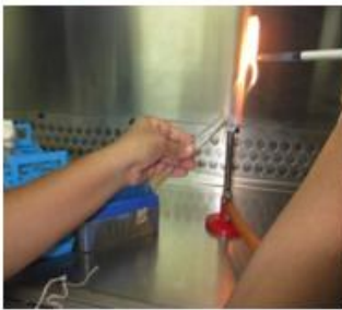
Fig 4: Bacteria added to test tubes