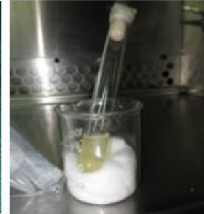
Fig 3: Subculturing the bacteria using Tryptic Soy Broth as the culture media