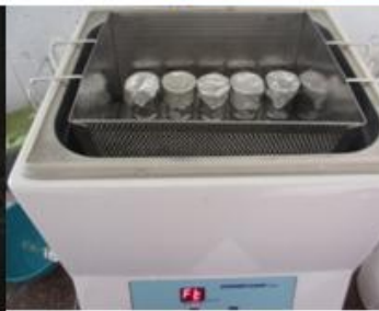
Fig 6: Adhered bacteria removed in an ultrasonic cleaner