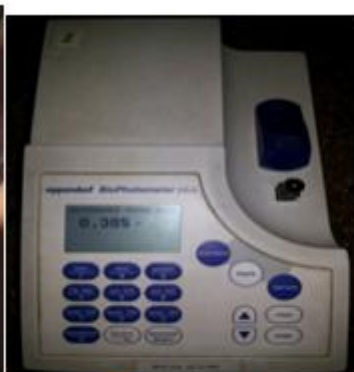
Fig 8: Optical Density measured using UV-Spectrophotometer