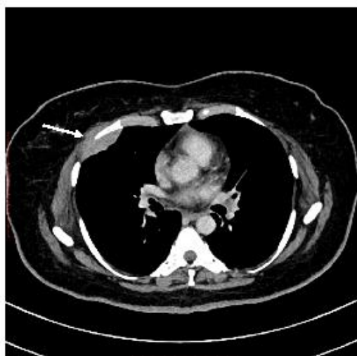
Fig 2: Axial CECT chest (mediastinal window) show ill defined deposit along right pleura (white arrow) .

On chest imaging there was evidence of multiple ill-defined plaque like heterogeneously enhancing lesions along bilateral pleura largest of size approximately 2.3 x 4.2 cm (AP x TRA) at the level of T6-T7 intervertebral disc extending into the chest wall without any rib destruction suggestive of pleural deposits (fig 2). There was no evidence of any intraparenchymal lesion.