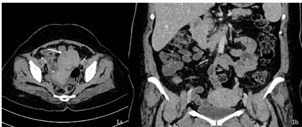
Fig 1a, 1b: Axial and coronal CECT pelvis show well defined homogeneously enhancing solid lesion in left adnexa with no calcification or cystic areas within with mild ascites.

for characterization of lesion and staging. In pelvis, there was evidence of a well-defined heterogeneously enhancing lesion of size 4.6 x 6.3 x 5.7cm (AP x TRA x SAG) in the left adnexa with few hypoenhancing areas within, mild ascites and no peritoneal nodules (fig 1).