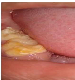
Fig - 6