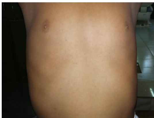
Fig - 3 Lower chest hollowing, Harrison's sulcus, Distended abdomen

On intra oral examination the child had enamel hypoplasia on 55, 65, 75 and 85 ,(Fig- 4,5,6,7) caries on 36 and 46, early exfoliation of primary teeth ( from 2 ½ years of age), partial hypodontia ( OPG reveals absence of tooth bud of 35) (Fig – 8)