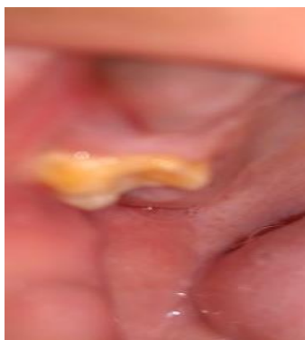
Fig- 4 Enamel hypoplasia 55.

On intra oral examination the child had enamel hypoplasia on 55, 65, 75 and 85 ,(Fig- 4,5,6,7) caries on 36 and 46, early exfoliation of primary teeth ( from 2 ½ years of age), partial hypodontia ( OPG reveals absence of tooth bud of 35) (Fig – 8)