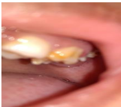
Fig -5 Enamel hypoplasia 65