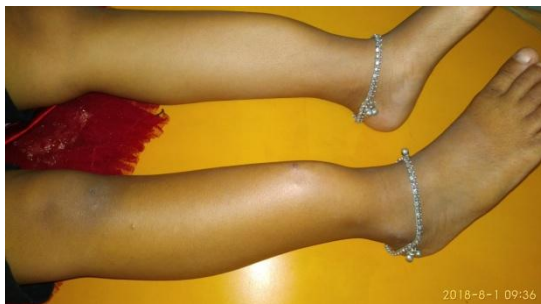
Fig - 2 Anterior bowing of Tibia