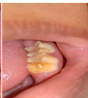
Fig – 7