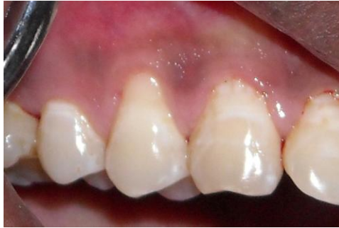
Fig. 1 Miller's class I defect with 14