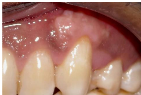
Fig. 9 Six months post- operative view