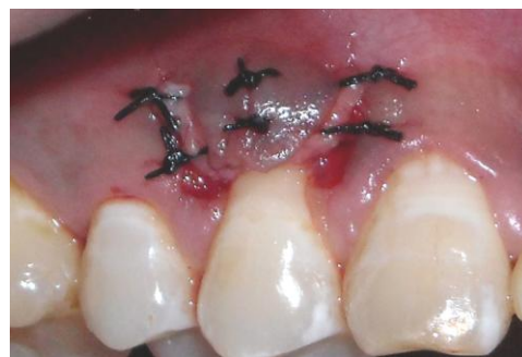
Fig. 6 Pedicle flaps sutured over connective tissue graft & denuded root surface