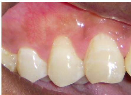
Fig. 7 Six months post- operative view