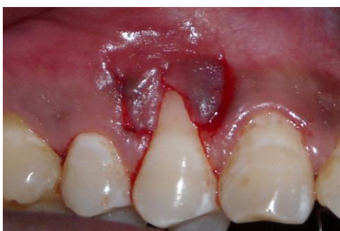
Fig. 2 Incisions placed

Double pedicle flap was designed by using #15 scalpel blade. Horizontal incisions were made mesial & distal to the defect, at a level of the CEJ towards the adjoining tooth. The incision was terminated not less than 0.5 mm away from the gingival margin of the adjacent tooth. This was done to avoid creating gingival recession on adjacent teeth. Next, vertical incisions were made perpendicular to the horizontal incisions & extending into the alveolar mucosa. A sulcular incision was placed connecting the horizontal incisions [Fig. 2]. Partial thickness flaps were then reflected [Fig. 3]. The most important function of the recipient bed is the capacity for rapid capillary outgrowth and granulation tissue formation to aid in vascularization of the graft. 3 This was done by sharp dissection as close to the periosteum as possible. The reflection was carried to a level that would permit free movement of the mesial & distal pedicle flaps. The flaps were placed over the defect to make sure that they would remain over the defect without being supported. If the pedicle flaps appeared to move with function, further reflection was done to free up the flaps. The mesial & distal flaps were then sutured with each other at the central area with 5-0 braided silk suture using interrupted suture technique. The template of desired dimension was fabricated for harvesting of the connective tissue graft.