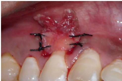
Fig. 5 Connective tissue graft sutured into recipient site.

Finally, the pedicle flaps were sutured with 5-0 braided silk suture over the connective tissue graft & the original defect, with sling and interrupted suture technique. [Fig.6]. Light pressure was applied to the grafted area with wet gauze for 10 to 15 seconds, to adapt the soft tissue wall to the tooth surface and eliminate dead space in which a clot might form and disrupt healing.