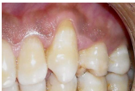
Fig. 8 Miller's class I defect with 23

The gingival recession at the end of six months was 0.5 mm [Fig. 9]. Thus, root coverage of approximately 1.5 mm was obtained. The percentage of reduction in gingival recession was 75% when calculated by the same formula.