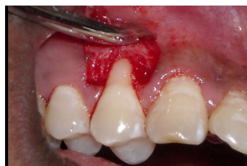
Fig. 3 Reflection of partial thickness pedicle flaps