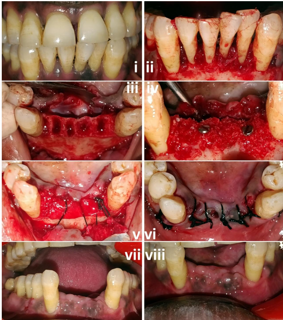
Figure 2: (i) preoperative image (ii) A full thickness mucoperiosteal flap was raised. (iii) extraction of the compromised teeth was done. (iv) stainless steel screws of size (1.5mmx8mm) along with stickybone was placed (v) stabilization of PRO-TISS® membrane with 5-0 silk sutures to attain primary closure. (vi) Immediate post operative. (vii) 3 months post operative (viii) 6 months post operative

Bhavana N et al "Ridge Augmentation Using Prf With Titanium Mesh Versus Screw Guided Bone Regeneration (S-Gbr): A Comparative Clinical And Radiographical Study." IOSR Journal of Dental and Medical Sciences (IOSR-JDMS) , 19(3), 2020, pp. 57-64.