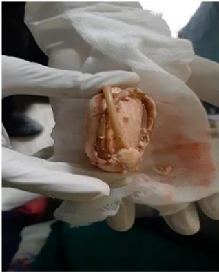
Bladder stone along with tube like foreign body.