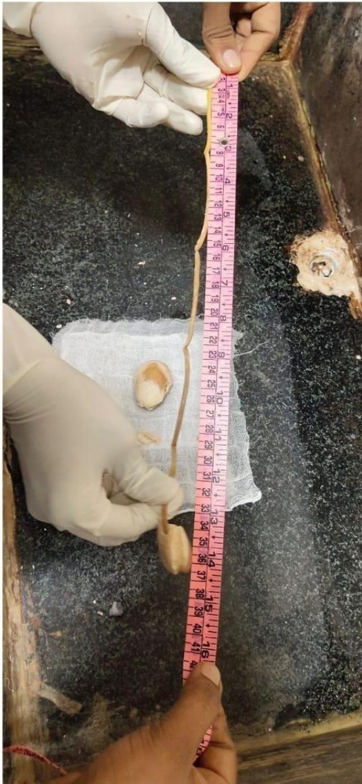
Bladder stone along with tube like foreign body measuring 36cm.