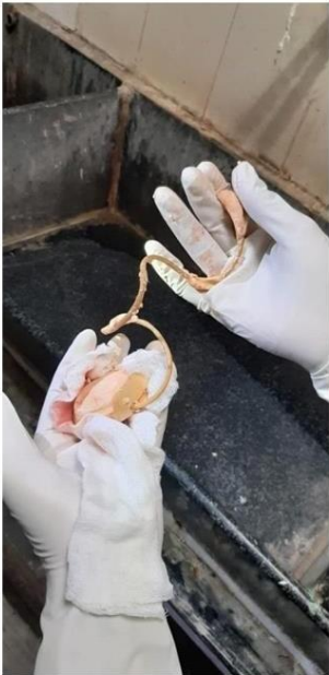
Bladder stone along with foreign body.