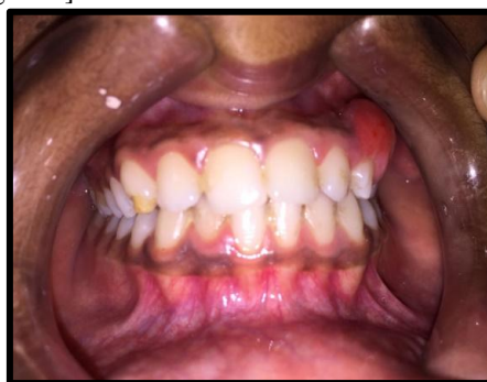
Figure 1: Gingival overgrowth present on the posterior maxillary region.

On examination a swelling was seen protruding from the upper gingival region. There was a pale pink swelling in the maxillary left region. The surface was nodular and regular, without any ulceration. The growth measured 2.2 × 2.0 cm in size and was extending out from buccal gingiva. The growth was firm in consistency, sessile and not easily movable. [Figure 1].