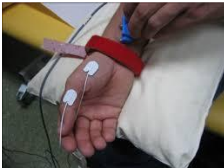
Photo 1- Median nerve stimulation at wrist