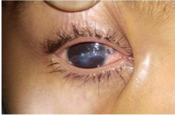
Picture 1 and 2 : Corneo-scleral tear repaired with B scan showing anterior segment distortion and anterior vitreous degeneration

In our study, total 76 eyes needed indoor admission. Forty five eyes operated for partial and full thickness corneo-scleral tear, fourteen eyes with traumatic cataract treated surgically with posterior chamber intraocular lens (PCIOL) implantation. Three patients operated for endophthalmitis and two were needed evisceration