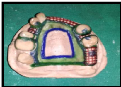
Fig. 6 wax-up for CPD