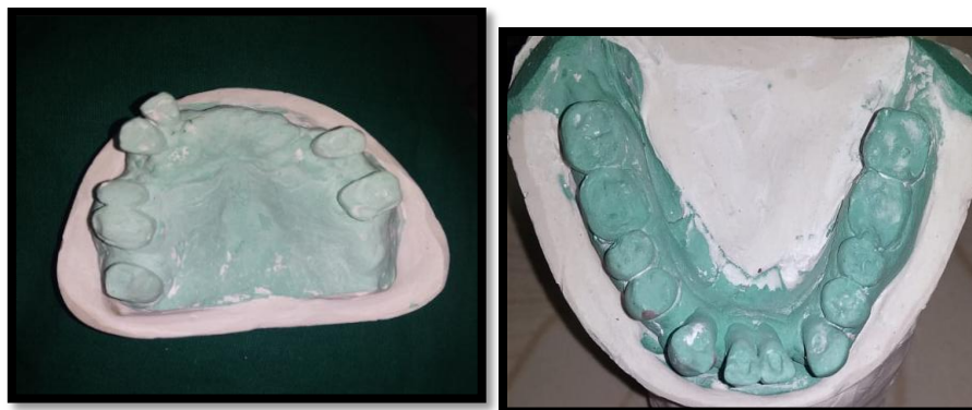
Fig.1 Diagnostic maxillary and mandibular cast