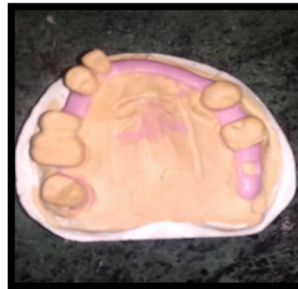
Fig. 5 surveying for upper CPD and block-out