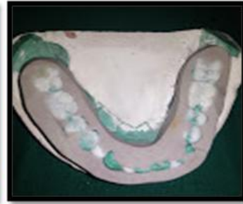
Fig. 3 putty index after plain correction