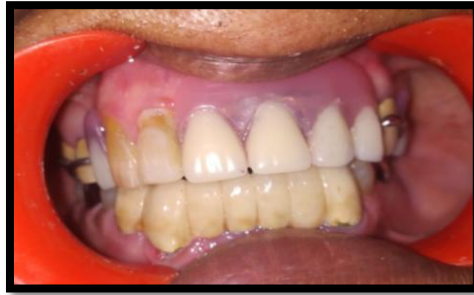
Fig.8 post treatment view