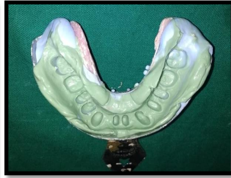
Fig. 4 maxillary and mandibular final impression after teeth preparation and plain correction