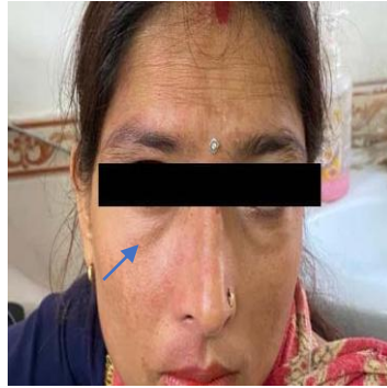
Figure 1: Female presenting with port-wine stain on right side of face (blue arrow).

similar stain or any other specific complaints. On gross examination, telangiectatic cutaneous capillaries were seen on the skin on the right side of the face. She had the best-corrected visual acuity of 6/6 in both eyes.