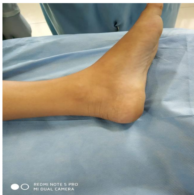
Pre-op image of the bony swelling

Radiography of the right ankle demonstrated a lobulated mass on the posteromedial part of the talus that was continuous with the cortex and medulla of the talus. The mass was connected to the medullary cavity of the talus