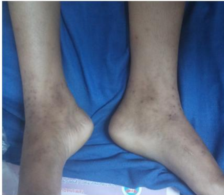
Fig 3c: Crops of purpuric spots over legs and feet