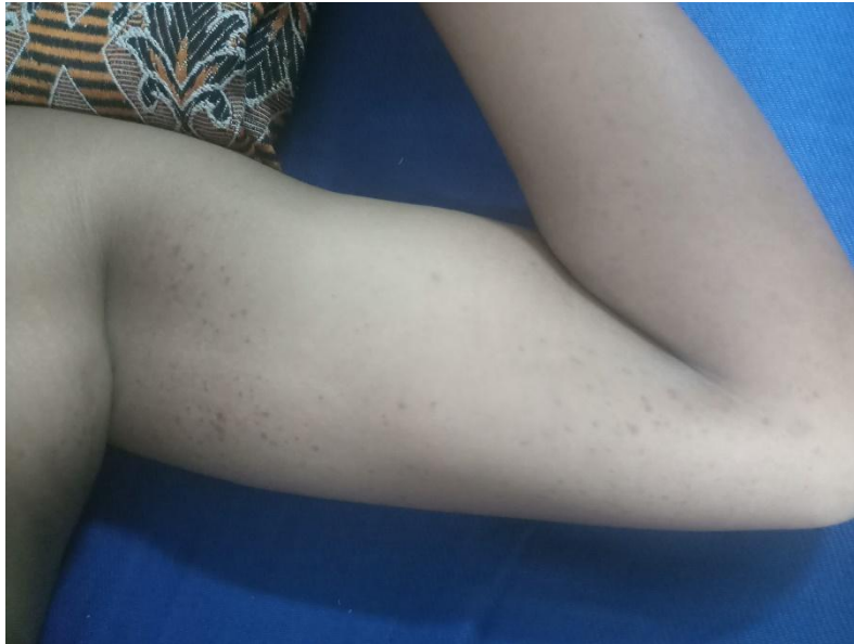
Fig 3b: Crops of purpuric spots over arm