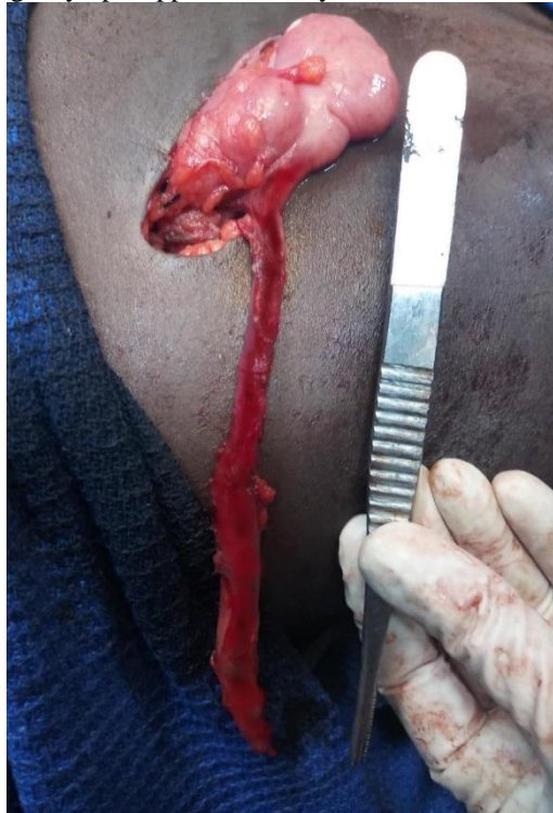
Fig 2: On table appendix specimen after ligating mesoappendix

Patient was taken up for an emergency open appendicectomy.