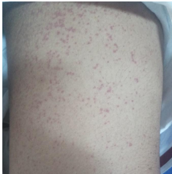
Fig 3a: Crops of purpuric spots over thigh

Renal parameters showed nephritic range proteinuria, hematuria. Patient started on IV steroids (Methylprednisolone 1mg/kg body wt) on Post Operative Day 4. Skin biopsy of the purpuric spots was taken, which confirmed leukocytoclastic vasculitis.