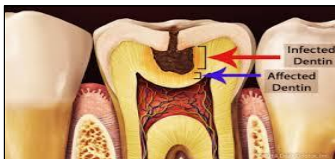
Pic.1 Pictorial representation explaining Infected and Affected Dentin

CMCR agents act by causing degradation of the partially degraded collagen in the infected dentine, without causing any damage to normal dentinal tissues. The technique involves applying of solution/gel to the carious dentin, allowing it to soften the tissue, and, finally, scraping it off with special hand instruments.