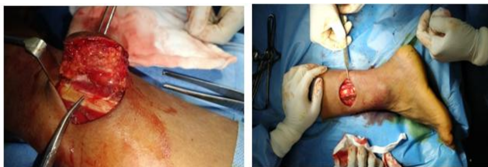
Fig.3: Intra operative photo showing the anterior margin of the swelling being excised from underlying muscle maintaining 2 cm margin from tumour.

As the original clinical suspicion of a soft tissue sarcoma was not resolved, Patient underwent wide local excision of the swelling with 2 cm margin. Intra operative findings showed a hard well circumscribed nonvascular tumour abutting but not invading the underlying muscles.