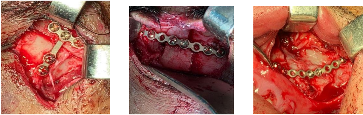
Figure 6. Fixation of the fractured points using of three plates and fifteen screws of the 1.5 mm system.

Postoperative tomographic exams showed a satisfactory reduction and fixation of the fractures. (Figures 7 and 8).