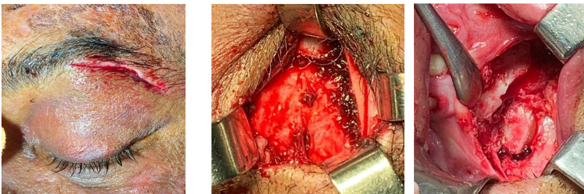
Figure 5. Access and reduction in the left superciliary region and intraoral vestibular access of the left maxilla.