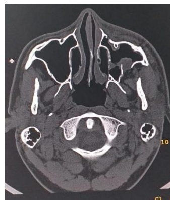
Figure 7. Postoperative tomographic image of the axial section showing the fixation of the fracture points.

Postoperative tomographic exams showed a satisfactory reduction and fixation of the fractures. (Figures 7 and 8).