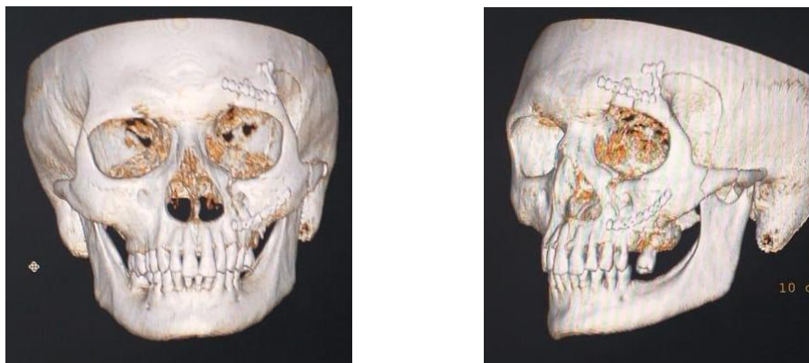
Figure 8. Postoperative 3D Reconstruction Tomographic Imaging 3D