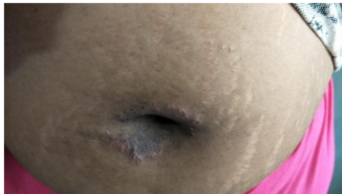
Taenia corporis near umbilicus