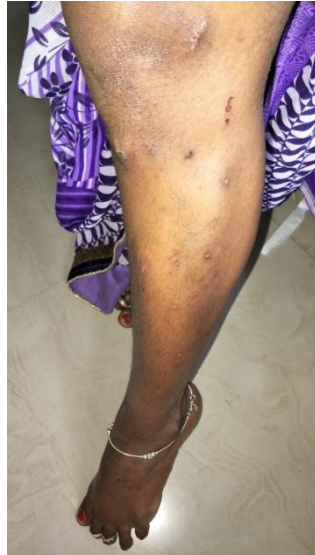
Atopic eruption of pregnancy