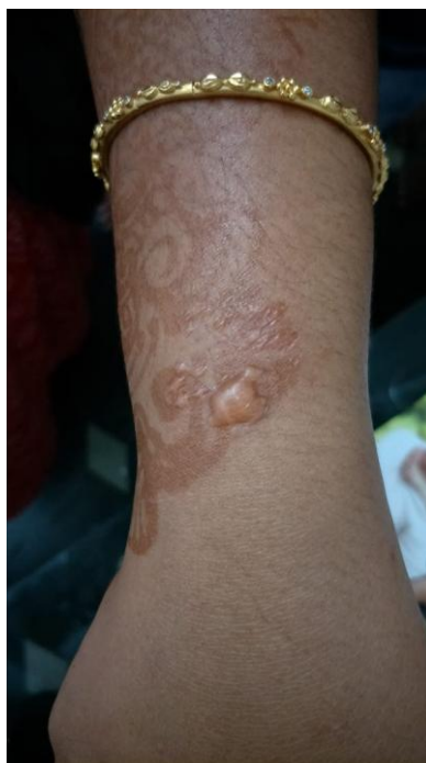
Bullous leison following henna with chemicals application.