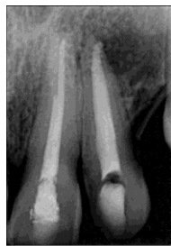
FIG.3 -6 Months follow up