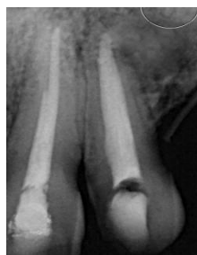
Fig.4-9 months follow up