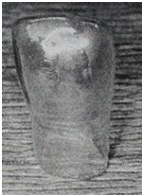
Cellulose Acetate crown