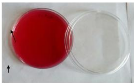
Fig 3: Culture plate showing no growth of microorganisms on first and second day.