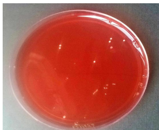
Fig:4 Growth of two different organism,