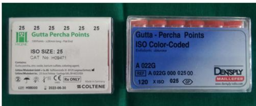
Fig 1. 25 sizes of two different manufactures of gutta-percha cones Dentsply and Coltene

processed for microbiological culture. The gutta-percha cones were picked up using a sterile laboratory forcep and added to a tube containing 1.5 mL saline. Volumes of 500µL were pipetted out and processed for culture in two different culture media namely, Blood Agar and MacConky culture media. They were aerobically incubated in an incubator at 37° C for 24 hours. (fig .2 ). Colony growth reading was taken after 24 hours of culture.