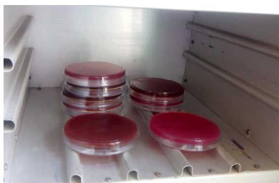
Fig: 2. Culture plate in an incubator

The same method was performed on day two and day three of opening the sealed packet, following all the aseptic measures and the microbial colonies were counted under the microscope in the lab. If any growth was noted on the culture plate, the bacterial colonies were counted and processed for microscopic examination for identification of microorganism by gram staining method.