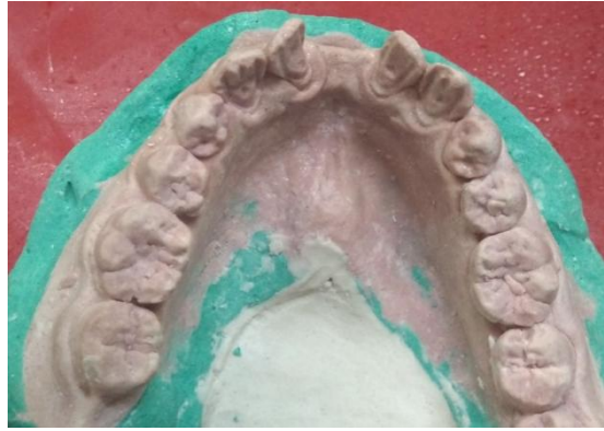
Figure 1 : Diagnostic cast of Prepared Abutment