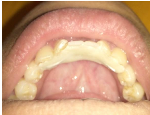
Figure 3: Final cementation of Interim Prosthesis