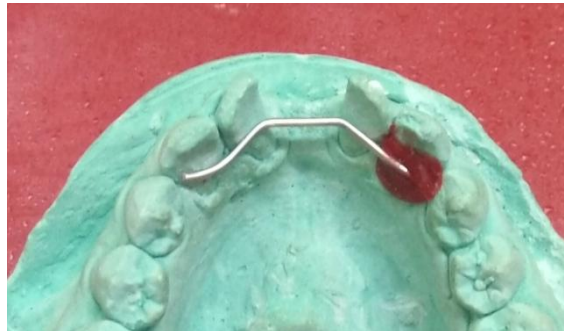
Figure 2 : Orthodontic wire adapted on the lingual surface of the abutment tooth