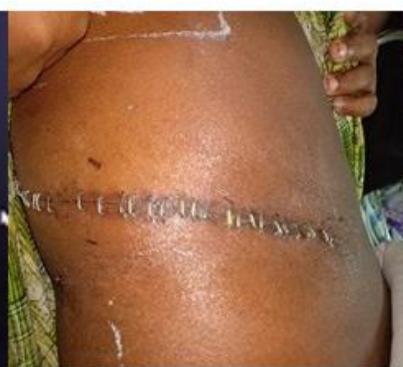
Fig.2.Right subcostal incision scar