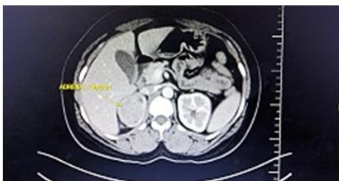
Fig.1 .-Showing sagittal section of right supra renal mass - pheochromocytoma