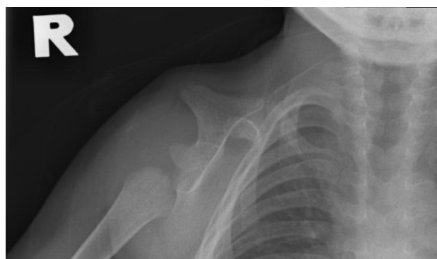
Fig-4 : Chest radiography of patient at 2 years of age.