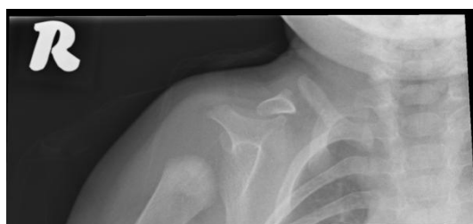
Fig-3 : Chest radiography of patient at 1 year of age.