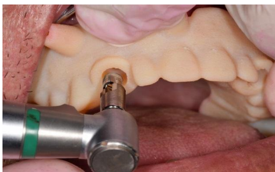
Fig 2. Implants placement steps using stereolithographic implant guide following All-on-4 protocol.