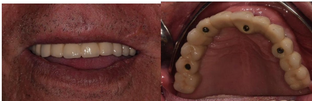
Fig 3. Insertion of the Fixed partial denture