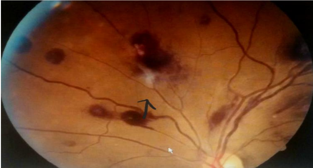
Figure 1: Pre-retinal Haemorrhages with Cotton Wool Spots in a patient with Severe Anaemia