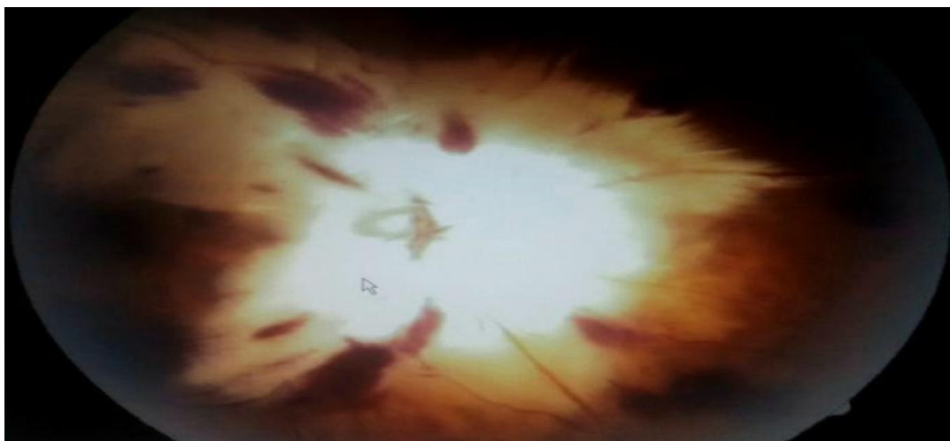
Figure 4: Papilloedema with Peripapillary Haemorrhages in Severe Anaemia with Thrombocytopenia