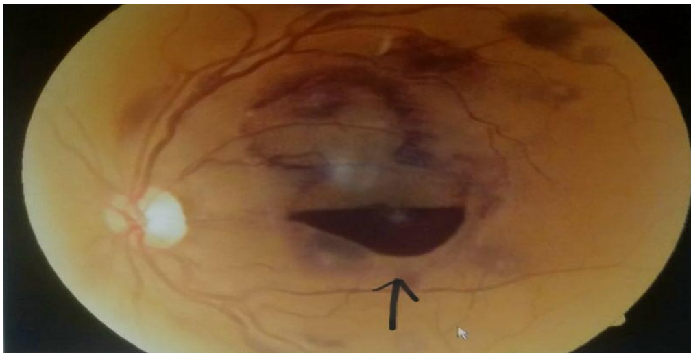
Figure 2: Subhyaloid Haemorrhage in Macular Area in patient with Severe Anaemia and Thrombocytopenia