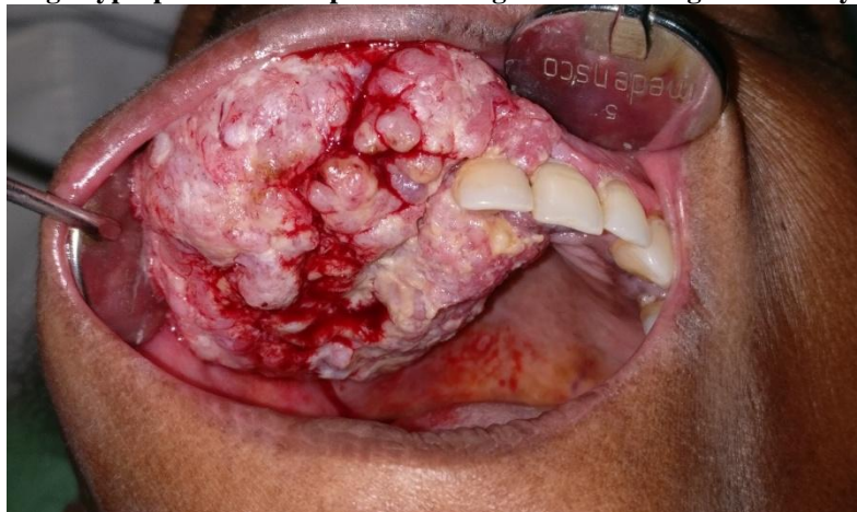
Fig. 1: Large hyperplastic ulcero-proliferative growth in the right maxillary region.

A 48-year-old female patient with a history of tobacco chewing presented to the Department of Oral and Maxillofacial surgery with a slow growing large hyperplastic ulcero-proliferative growth in the right maxillary region. Clinical examination and radiographic CT scan assessment revealed a large soft tissue mass with superficial maxillary dento-alveolar involvement extending from the left central incisor to the right 1st molar region and from the gingivo-buccal sulcus region to the palatal side and crossing the palatal midline. No lymph node involvement was evident on clinical and radiographic examination. Deep incisional biopsies were taken from 3 different regions of the lesion which provided a provisional diagnosis of verrucous carcinoma. A sub-total maxillectomy on the right side was performed with an extension up to the left maxillary canine while maintaining a safe margin of 15 mm in all dimension. Primary reconstruction of the defect was performed with an antero-lateral thigh flap. An elective neck dissection for levels 1 to 3 on the right side was performed owing to the large extent and long-standing nature of the lesion. The final histo-pathological confirmed the diagnosis of verrucous carcinoma and all margins and lymph nodes were free of disease. (Fig.1)