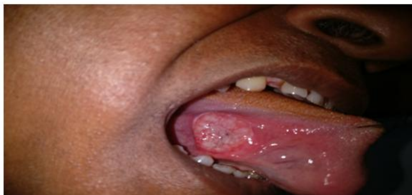
Fig.2: Lesion on posterior region of tongue on the right side.

A 53-year-old female patient with a history of tobacco chewing presented to the Department of Oral and Maxillofacial Surgery with a history of long-standing pain and bleeding from the posterior region of her tongue on the right side. On clinical examination, a ulcero-proliferative lesion of approximately 2 cm in diameter was present on the lateral aspect of the right half of the tongue at the junction of the anterior 2/3rd and posterior 1/3rd. CT scan and MRI assessment revealed a lesion with a superficial diameter of 2 cm and depth of 0.5cm with no lymph-node involvement. A wide local excision while maintaining margins of 15mm in all dimensions was performed followed by primary closure of the defect. An elective neck dissection for levels 1 to 3 nodes was performed on the left side owing to the highly vascular nature of the tongue and depth of lesion. Histopathological examination revealed that the lesion was verrucous carcinoma and all margins and lymph-nodes were free from disease. (Fig.2)