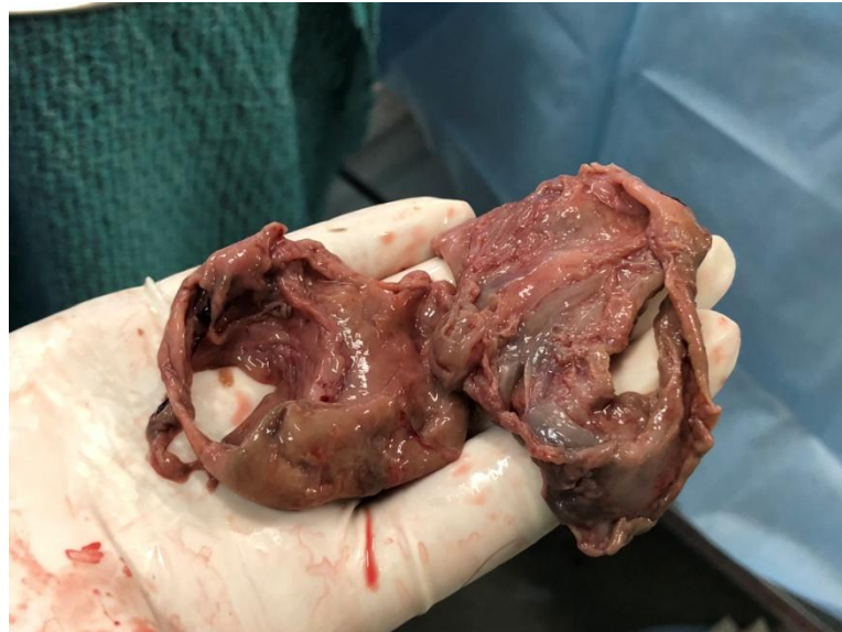
Fig1- Show Necrosed dome and posterior wall of the Urinary bladder

100cc of pus and clot was drained from urinary bladder. Stomach, bowel and rest of solid organs appear normal. Urinary bladder wall freshened and margins sent for histopathological examination which later on revealed chronic benign lesions( Fig2. )