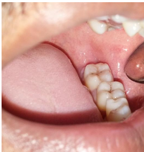
[Figure 4]: Postoperative view of the region