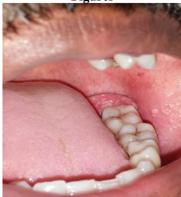
[Figure 1]:Preoperative view of the lesion