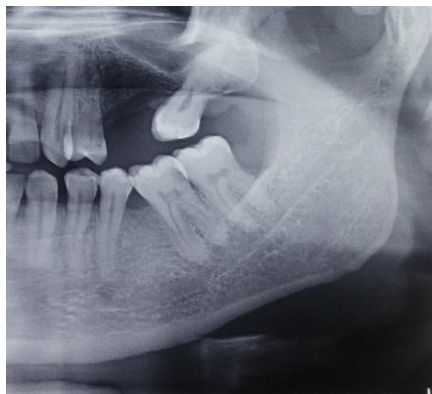
[Figure 5]: Postoperative radiograph