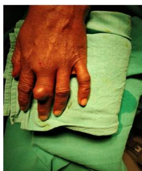
Fig 1 – Pre-operative