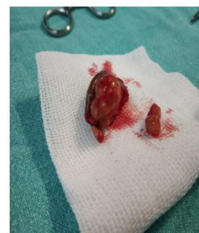
Fig 3 – Gross specimen