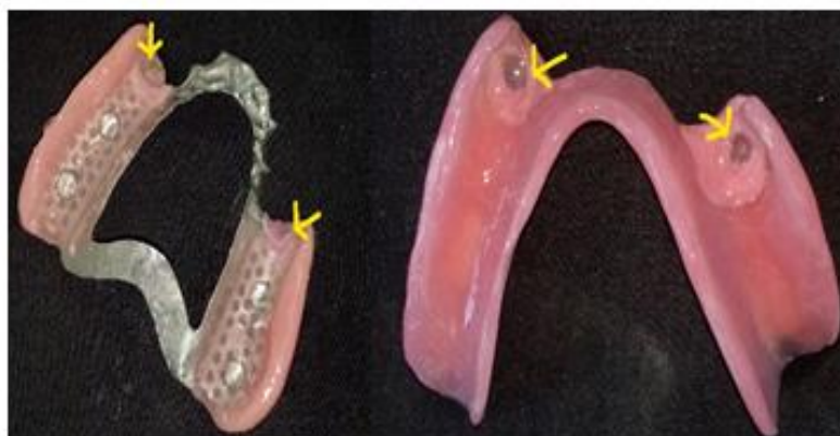
(Figure: 10 Final denture with Female component)

patient's mouth and checked. Post insertion instructions and cleaning of the prosthesis were given to the patient.(Figure 10)