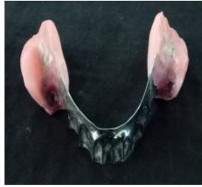
Figure no. 10 Tissue surface of the attachment retained cast partial denture showing the retentive caps

Finally, the upper complete denture and the lower attachment retained cast partial denture was fitted in the patient's mouth and the occlusion was checked. Esthetics and speech were also assessed. Figure no.11 shows the frontal view of the patient after the insertion of the prosthesis.