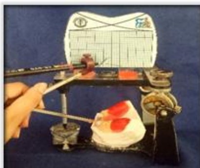
Figure no.3 Occlusal plane determined by Broadrick plane

On which putty index were made which help while final tooth preparation. Then mandibular anterior teeth 33 and 43 were prepared for the metal-ceramic prosthesis. After that temporary prosthesis was fabricated and evaluated in patient's mouth for esthetics and phonetics. Then after temporary prosthesis was cemented using zinc oxide eugenol cement.