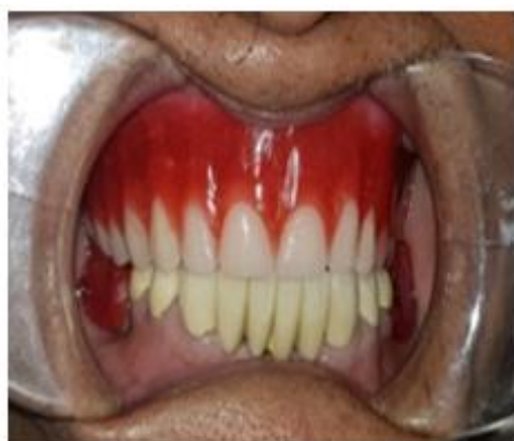
Figure no.7 Final cementation of mandibular teeth

The impression for cast partial denture framework was taken using PVS impression material and sent to the laboratory. The cast was poured with type IV gypsum and was scanned by Exocad software and then cast partial denture framework was designed. Mandibular plate type of major connector was selected. All scanned data than send as STP file to the milling machine(figure no.8). After milling final cast partial framework was finished and polished.