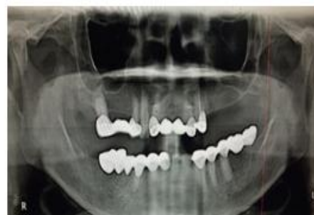
(Figure: 2 Radiographic examination)