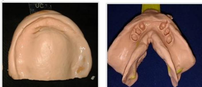
Figure no.1 Primary impressions

All periodontal and intentional endodontic therapies were completed first and then the patient was referred back to the Department of Prosthodontics. The preliminary impressions were taken (figure no.1), over which custom made tray was fabricated.