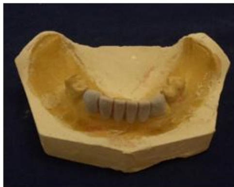
Figure no.2 Mockup of mandibular anterior

Border molding was carried out using green stick compound and final Impressions were made by dual impression technique. To evaluate the vertical dimensions and to recheck the inter-ridge space, the jaw relations were recorded. Face bow (Hanau, Waterpik, Ft Collins, CO, USA) transfer is done and mounting was done in semi adjustable articulator. (Waterpik, Ft Collins, CO, USA) After this, the actual treatment was started with reducing the crown height of the remaining teeth and diagnostic mock-up was done (figure no.2)