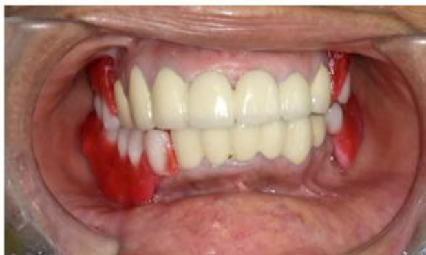
(Figure: 9 Try in of maxillary and mandibular denture)

Maxillomandibular relation was recorded and mounted on semi-adjustable articulator using facebow. Teeth arrangement was done and wax try in done (Figure 9).