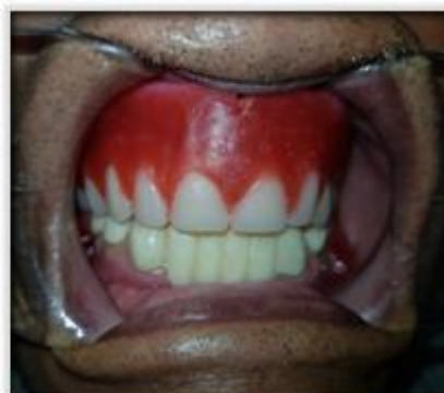
Figure no.4 Temporization of mandibular teeth

The posterior occlusal plane was determined by Broadrick plane analyzer (figure no.3). The posterior teeth 34, 35, 44 and 45 were prepared and on which mock-up was done. Teeth setting of all maxillary anterior teeth and mandibular posterior teeth 36, 37, 46, 47 were done according to determined occlusal plane. Putty index of mock-up was taken which helped for final preparation.