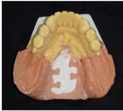
Figure no.9 Cast poured with altered cast technique