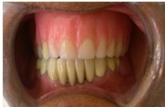
Figure no.11 Insertion of prosthesis

Finally, the upper complete denture and the lower attachment retained cast partial denture was fitted in the patient's mouth and the occlusion was checked. Esthetics and speech were also assessed. Figure no.11 shows the frontal view of the patient after the insertion of the prosthesis.