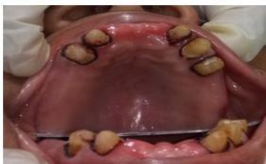
(Figure: 4 Intraoralocclusal view of prepared maxillary teeth with gingival retraction)

After diagnostic model study, Diagnostic casts were articulated on a semi-adjustable articulator using facebow at the anticipated vertical dimension of occlusion, following which diagnostic wax-up was done within the mounted cast. The tentative articulation helped in assessing the available inter-arch space, and this was found to be adequate. So, fixed partial denture was planned on 15 to 23, followed by attachment retained (Preci-Sagix, CEKA Attachments, Swiss) cast partial denture in maxillary arch and fixed partial denture was planned on 42 to 35 in mandibular arch, followed by mandibular RPD overdenture with O-ring attachment. 14, 13,12,22 and 23 were prepared to receive porcelain fused to metal bridge in maxillary arch and 42, 41, 31,32,33 and 34 were prepared to receive porcelain fused to metal bridge in mandibular arch (Figure 4).