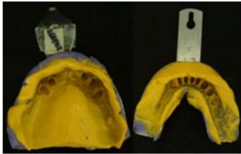
(Figure: 5 Final impression)