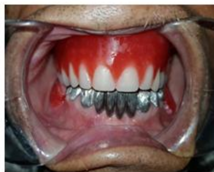
Figure no. 6 Metal try in

After checking of fitting of metal, ceramic build up was done. Final prosthesis was undergone finishing, and polishing. And then final prosthesis was cemented using glass ionomer luting cement (GC FUJI 1, GC Corporation, Tokyo, Japan)(figure no.7).