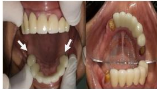
(Figure: 6 Final cementation with sagittal attachment in maxillary arch)

After cementation of fixed prosthesis, maxillary impression was made in polyvinyl siloxane impression material (Imprint™II, 3M ESPE, Germany) and poured in die stone. Cast partial framework was designed on the master cast using CAD-CAM technology and the entire cast partial framework was cast in Co–Cr alloy (Bego, Dentaureum, Germany).