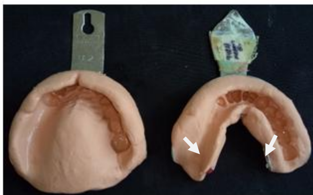
(Figure: 3 Diagnostic impression)

Treatment was planned by accordance to patient's esthetic need and economical condition. Treatment plan included Removal of all old fixed prosthesis first then evaluating the remaining teeth. After evaluation it was found that 35 and 43 had carious lesion and 16 had grade 2 mobility. Hence, the patient was advised to undergo extraction of 16 and endodontic treatment of 35 and 43. After completing the all endodontic treatment and extraction. On oral examination, teeth missing in maxillary arch were 15,16,17,24,25,26,27 and in mandibular arch missing teeth were 36,37,44,45,46,47. Diagnostic impression was made (Figure 3).