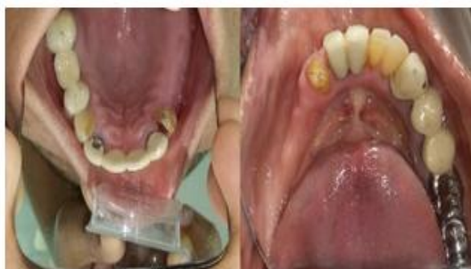
(Figure: 1 Preoperative occlusal view of maxillary and mandibular arch)

A 48-year-old female patient reported to the Department of Prosthodontics with the chief complaint of inability to chew food properly due to multiple missing teeth in maxillary and mandibular arch. Medical history was not significant. On oral examination, old prosthesis porcelain fused to metal bridge from 12 to 22 and 14 to 16 and 23 was endodontically treated with porcelain fused to metal crown were present in maxillary arch and porcelain fused to metal bridge from 41 to 46 and 33 to 35 with metal bridge in 36 and 37 present in mandibular arch (Figure 1). After radiographic examination it was found that there was a long span cantilever bridge were made previously on 33 to 37 in which 36 and 37 was cantilevered and 41 to 46 where 44,45,46 was cantilevered (Figure 2).