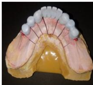
Figure no.5 Wax pattern with Rhein Attachment

the castable parts of Rheine 83 attachment, metal try in of the casted pattern was done in the patient's mouth to check the fit of the prosthesis.(figure no.6)