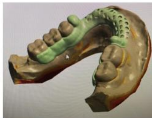
Figure no.8 cast partial denture framework fabricated with CAD-CAM

The fitting of framework was checked in patient's mouth and border moulding was carried out with green stick compound. Then wash impression was taken with zinc-oxide eugenol impression paste. The cast was poured using altered cast technique (figure no.9). The cast is mounted on articulator and mandibular posterior teeth setting was done and checked it in a patient's mouth. Theacrylization of Mandibular RPD and maxillary complete denture was done using DPI – Acrylyn H. The finishing and polishing of the both dentures were accomplished assess esthetics, occlusion and speech. With the help of self-cure acrylic resin using DPI-Cold Cur, the retentive caps were picked up within the partial denture (figure no.10).