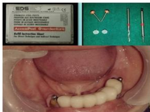
(Figure: 7 Access post placement in 35 and 43 in mandibular arch)

After cementation of fixed prosthesis in mandibular arch Abutment teeth 35 and 43 were prepared with a dome-shaped contour hemispherically rounded in all dimensions up to gingival line. Preparation for the "O-ring" direct access post was done with the primary reamer and countersink drill (Access Post Overdenture, Essential Dental systems) (Figure 7).