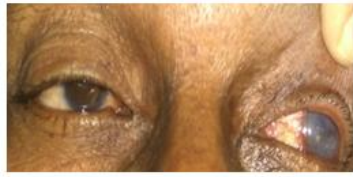
Fig 7: preoperative picture