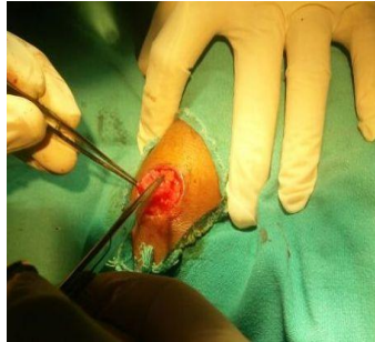
FIG :3: harvesting dermis fat graft from peri umbilical region.