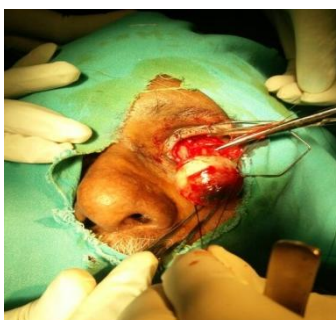
fig 2 :enucleaton of the eyeball