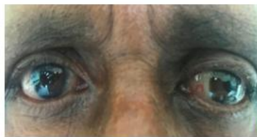
Fig 9: post operative 6 months