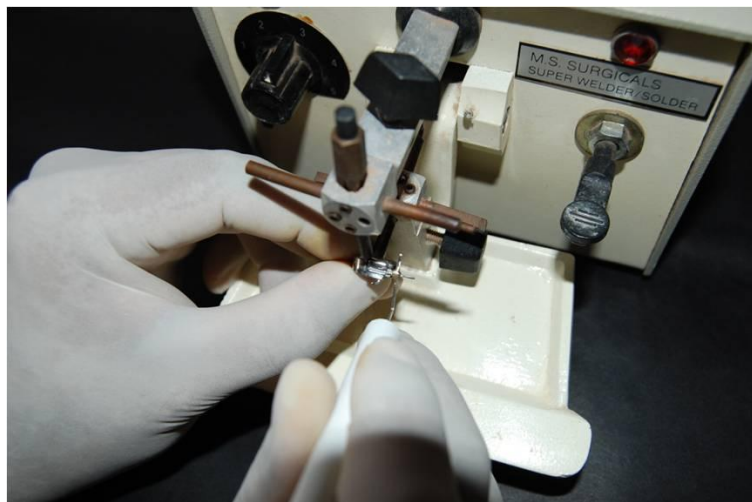
Figure-9: Spot welding of molar tube on to the molar band with the help of jig