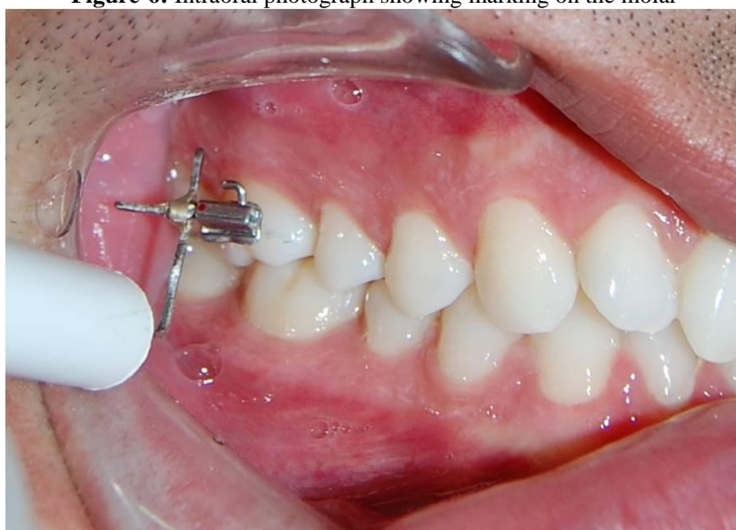
Figure-7: Intraoral photograph showing placement of bondable molar tube on to the molar with the help of jig