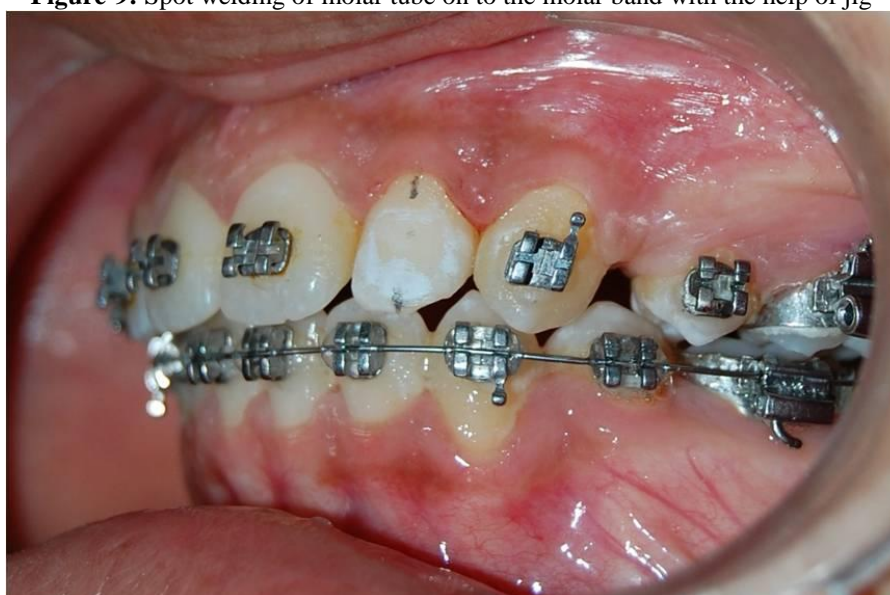
Figure-10: Intraoral photograph showing debonded bracket on the lateral incisor