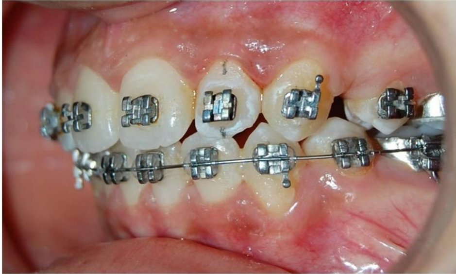
Figure-12: Intraoral photograph showing rebonded lateral incisor bracket.