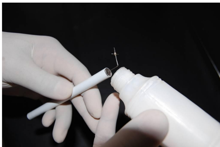
Figure-5: Embed one end of the wire into the acrylic tubing, so as to make a handle for the jig