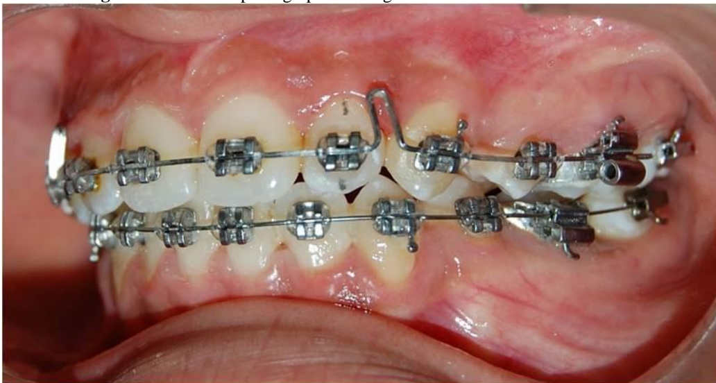
Figure-13: Intraoral photograph showing placement of 0.019x0.025" stainless steel wire in all the bracket slots

1Dr. Praveen Kumar Prabhu " Multipurpose Jig for Welding, Bonding Molar Tubes and Rebonding Debonded Brackets."IOSR Journal of Dental and Medical Sciences (IOSR-JDMS), vol. 17, no. 9, 2018, pp 24-29.