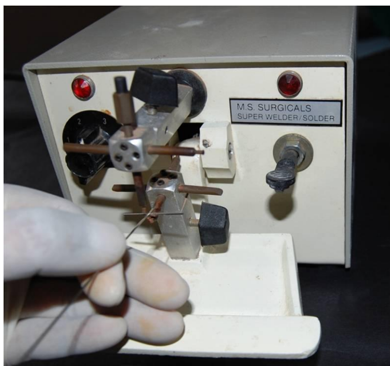
Figure-2: Tack weld two 0.019x0.025" stainless steel wires perpendicular to each other