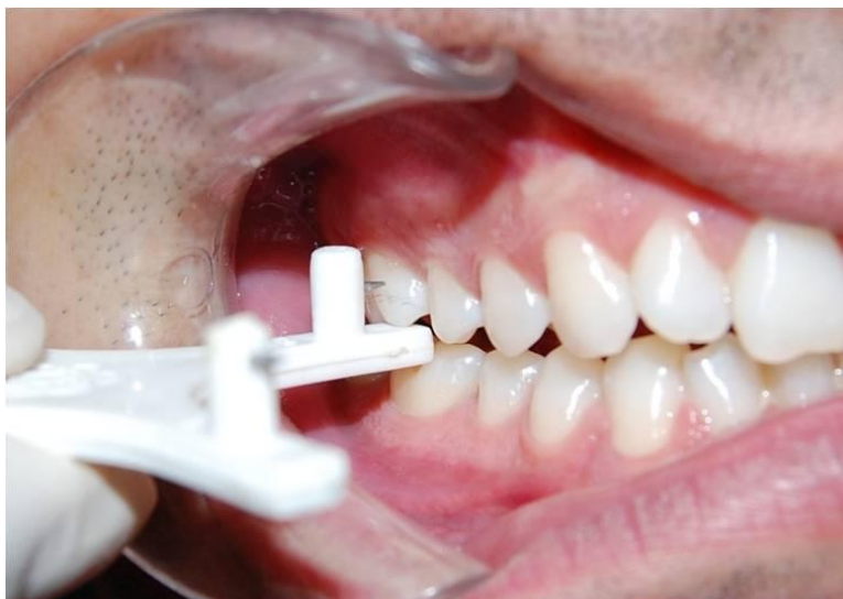
Figure-6: Intraoral photograph showing marking on the molar