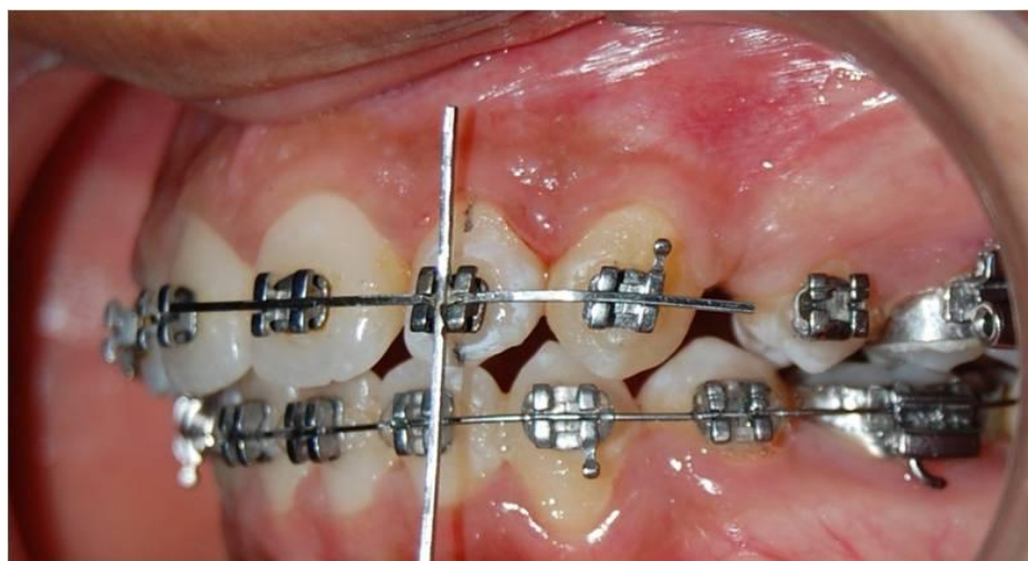
Figure-11: Intraoral photograph showing orientation of recycled deboned bracket on to the lateral incisor