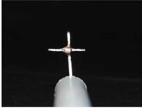
Figure-3: Soldered wire