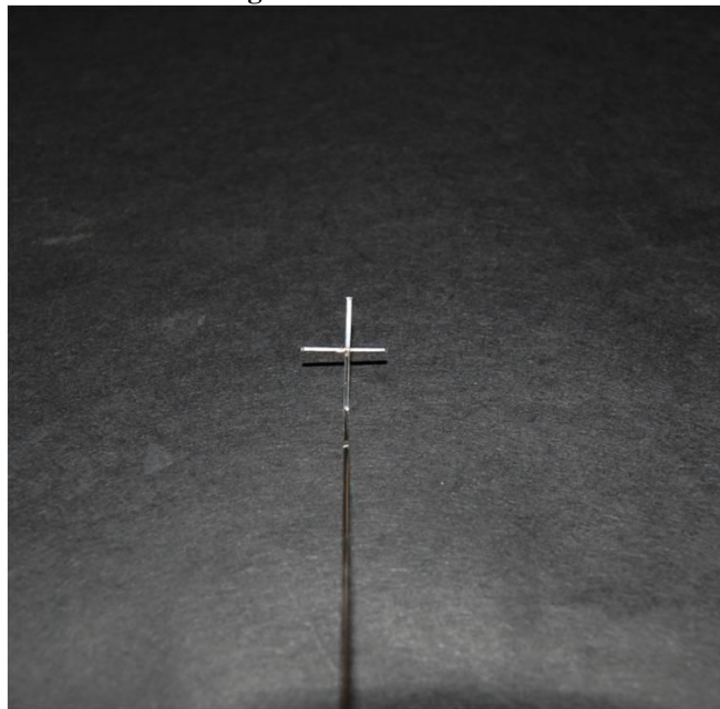
Figure-4: Incorporation of 90° bend into the wire