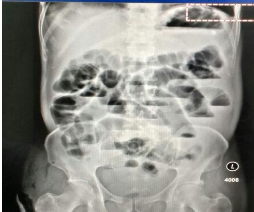
Figure 1: Abdominal X-ray with multiple fluid levels

Ultrasound abdomen showed dilated hypo-peristaltic small bowel loops with maximum calibre of around 3.7 cm. There was no free-fluid in the peritoneal cavity and rest of the findings were unremarkable. A clinical diagnosis of acute intestinal obstruction was made, and the patient was taken up for emergency laparotomy after initial fluid resuscitation.